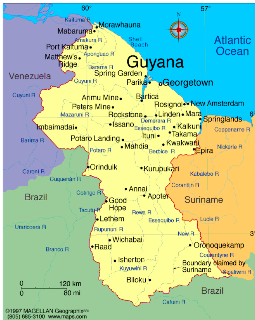
Figure 1 Guyana's constitutional borders, capital and towns

Guyana is a country situated on the mainland continent of South America bordered to the East by Venezuela, West by Suriname, South by Brazil and in the North by the Atlantic Ocean. (See figure 1 below) The population is concentrated in the country's capital, Georgetown and across other towns and communities as identified in figure 1.