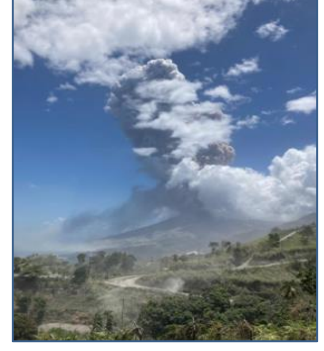
Eruption plume from the April 22, 2021 11:09am vulcanian explosion at La Soufriere Volcano. The lingering ash cloud from a pyroclastic density current that went towards the west is still visible above the western flank of the volcano.