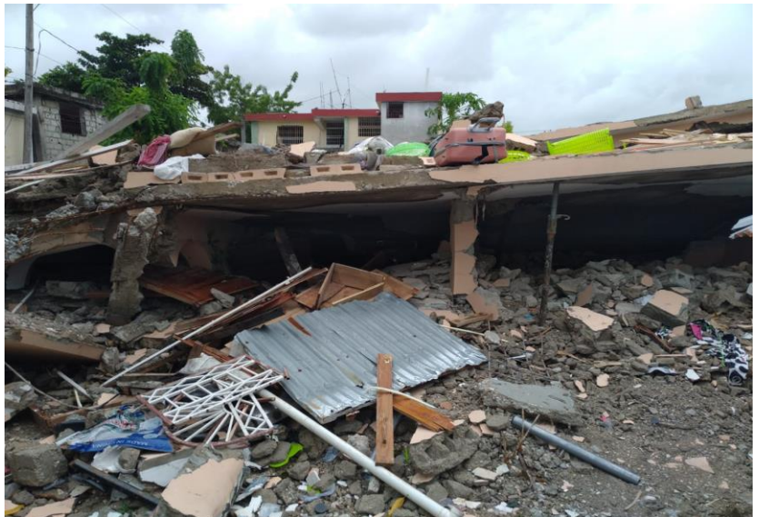
Collapsed home in Les Cayes where 6 persons died