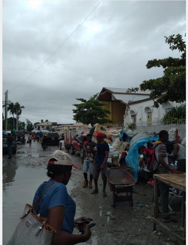
Damaged cathedral and commercial activity in Les Cayes.