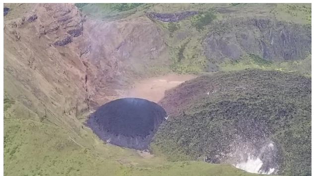
Aerial Photos of La Soufriere, St. Vincent taken on 3 rd January 2021.