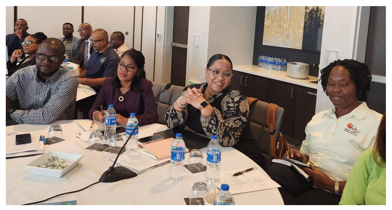
A cross-section of workshop participants