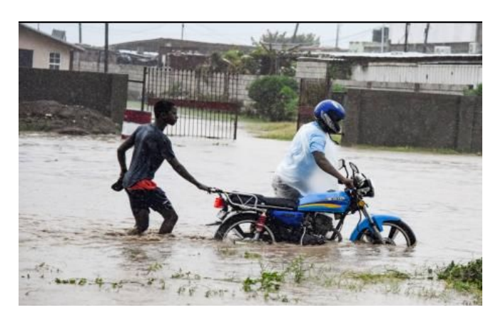
Jamaica Gleaner August 18, 2021