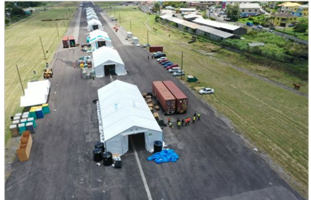
Mobile Storage Units set up at the Arnos Vale Logistics Hub